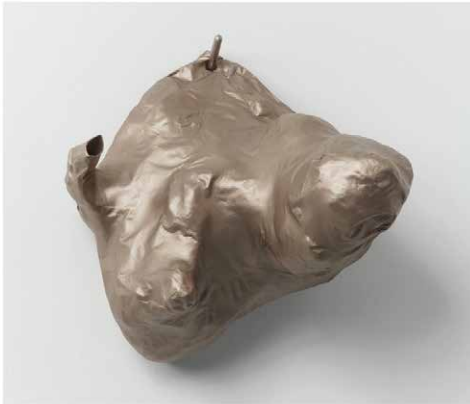
Arlene Shechet. "Origins." 2019. Bronze and steel, 12.5 inches by 11.5 inches by 10.5 inches. (Phoebe d'Heurie)