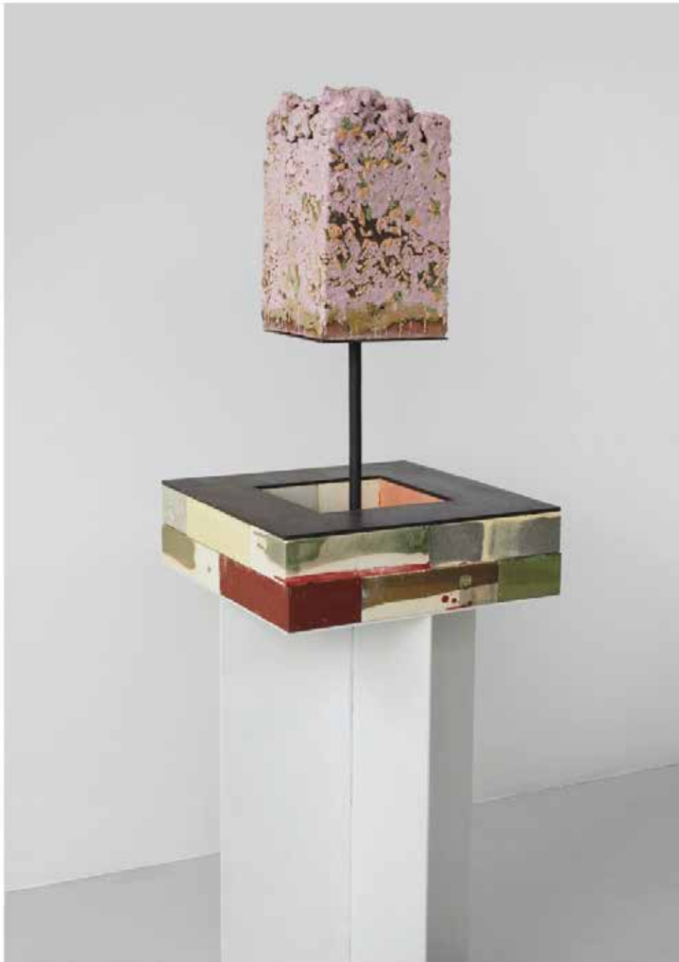
Arlene Schechet, "Fictional Exchange," 2019. Glazed ceramic, glazed firebrick, steel 61 inches by 18 inches by 18 inches.

"The Queen," a slender, slightly dented shaft of cast concrete crowned with scalloped-edged bronze, winks at Brancusi, and the craggy pink pillar rising out of the center of "Fictional Exchange" brings to mind Claes Oldenburg's melting Good Humor bar.